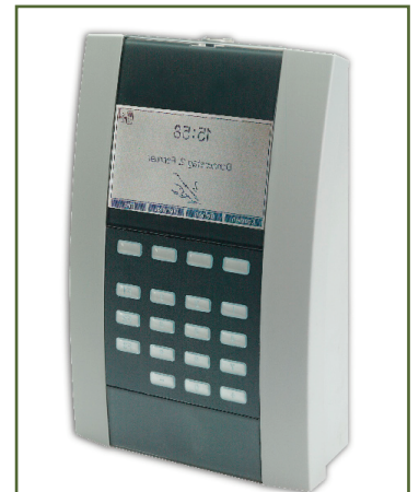
Time and Attendance terminal (Honeywell)